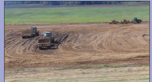
Landforming near the Toe of the Levee