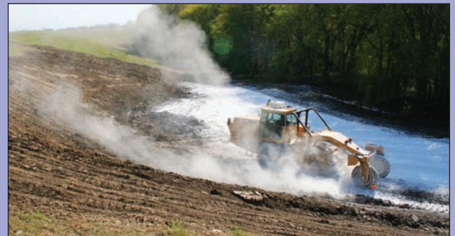
Mixing Material with Lime