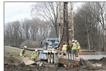
Above Greenville – Installing Relief Wells