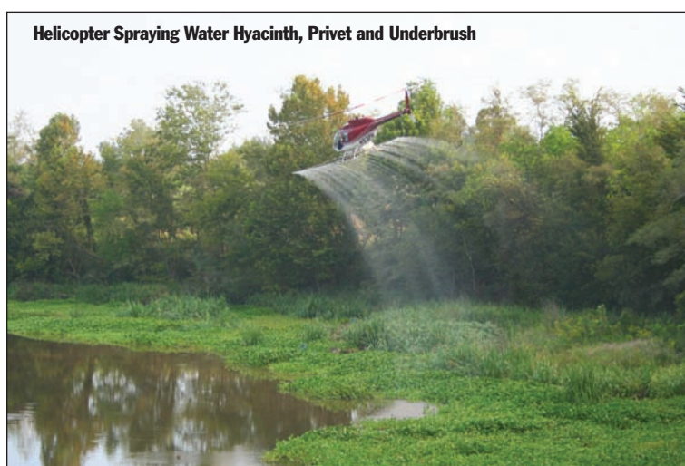
Helicopter Spraying Water Hyacinth, Privet and Underbrush

This year the Mississippi Levee Board treated 139 miles of its interior streams. This included 1,193 acres of interior streams located primarily in the northern half of the Mississippi