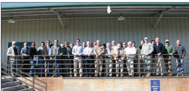
Members of the 2012 Annual Levee Inspection take a photo in front of the Greenville Yacht Club.

On November 14, 2012, the Mississippi Levee Board hosted its Annual Levee Inspection. This year's trip inspected the north portion of the levee system starting at the Item 616L — Francis Relief Well Project on the Mainline Mississippi River Levee and proceeding south on the levee including the Item 543L — Above Greenville Relief Well Project.