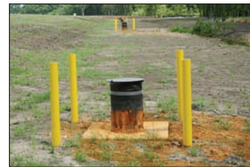
Above Greenville – Finished Relief Well