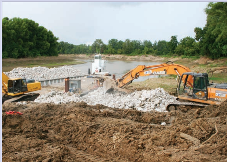
Yazoo River – Bank Stabilization Project

All required reset items are currently being constructed