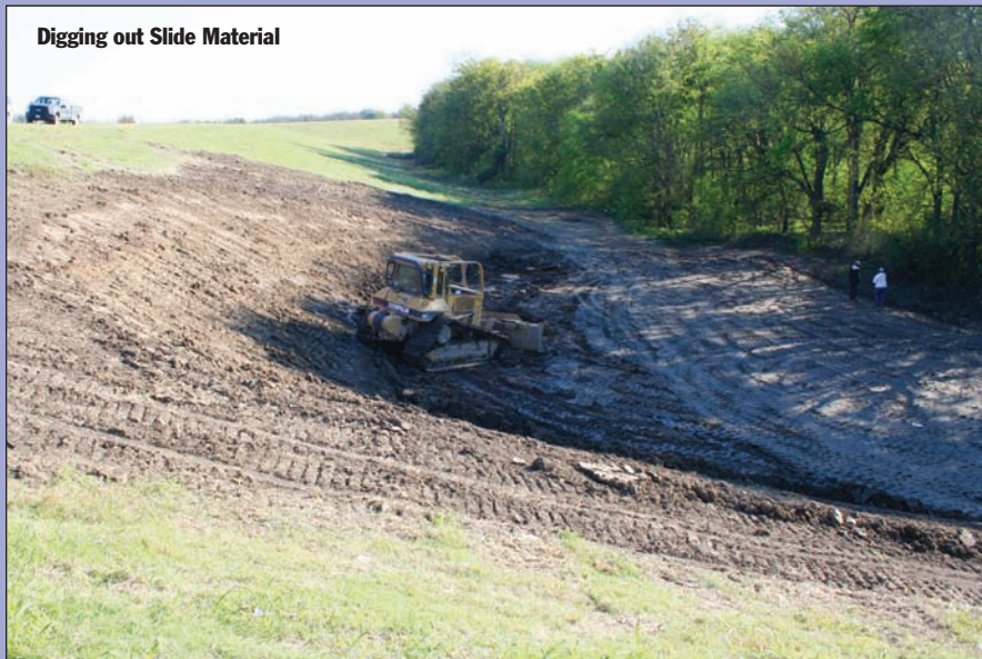
Digging out Slide Material