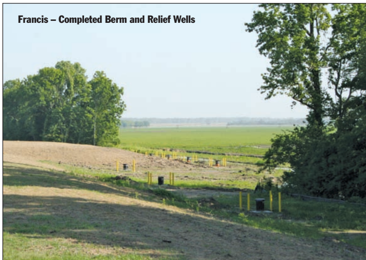
Francis – Completed Berm and Relief Wells

Plans for the remaining five (5) reset items have been consolidated into one project called Operation Watershed Recovery. The bid opening is scheduled for Fall 2013. The Vicksburg District plans to build a berm and install relief wells at Avon, and install relief wells at Greenville, Leota, Lake Jackson and Ben Lomond. ■