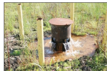
Buck Chute – Relief Well Flowing