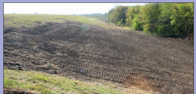
Completed Slide Repair

This levee slide located in Greenville was one of 26 slides repaired by the Corps of Engineers from April 2012 through November 2012. ■