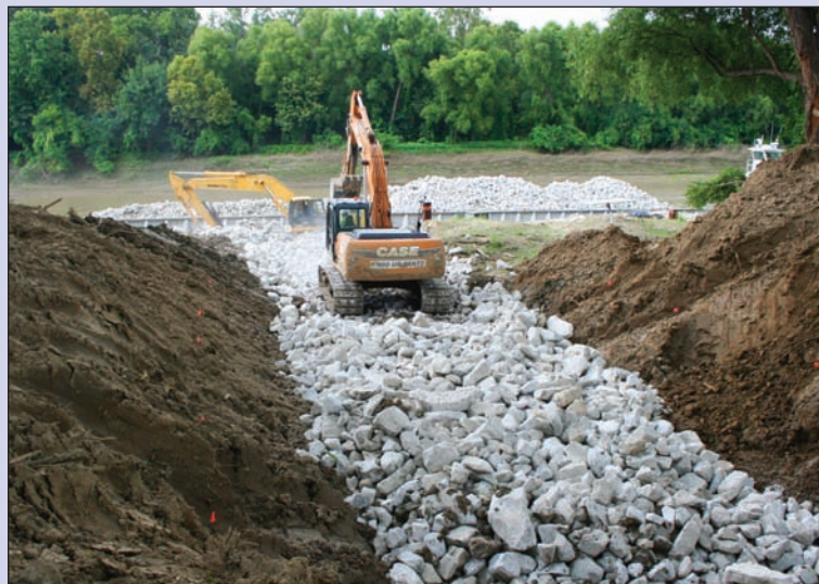
Yazoo River – Placing Rip Rap Rock in Tie-Backs

The Mississippi Levee Board is looking forward to the upcoming Levee Certifications for the Mainline Mississippi River Levee; the Brunswick Extension Levee; the Greenville Harbor Dike and the Yazoo Backwater Levee. All these levees are part of the MR&T Project.