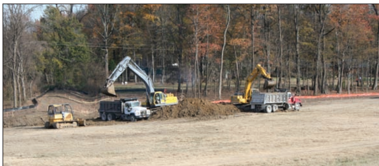
Above Greenville – Ditching and Berm Repair

relief wells at Buck Chute (Item 458L) and build a 2,500' long, 150' wide landside seepage berm at Albemarle (Item 465L). Phylway completed the Buck