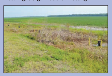
Francis Relief Wells Flowing