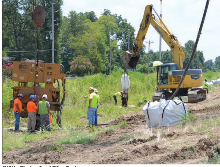
AVON - Placing Sand Filter Pack

The remaining five (5) reset items have been consolidated into one project called Operation Watershed Recovery. This project was awarded to Magruder Construction Co., Inc., in