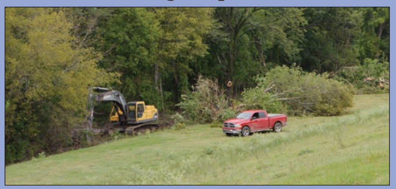
511L - Clearing the riverside toe

Work continuing despite limited funding from Congress