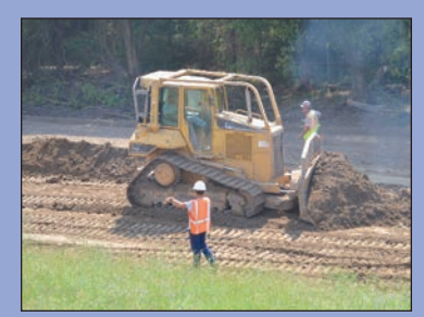
511L - Spreading material