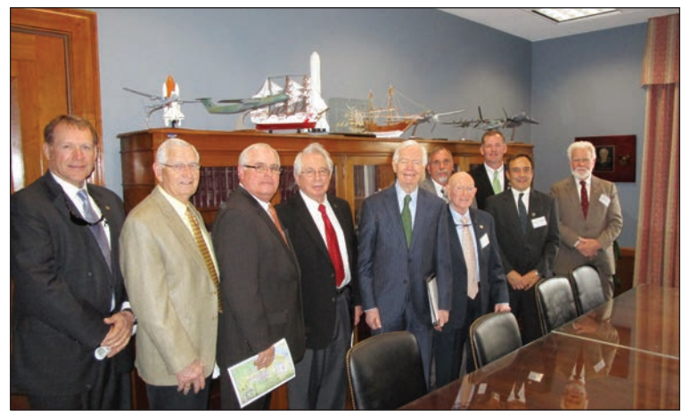
Sen. Thad Cochran with Mississippi Levee Board