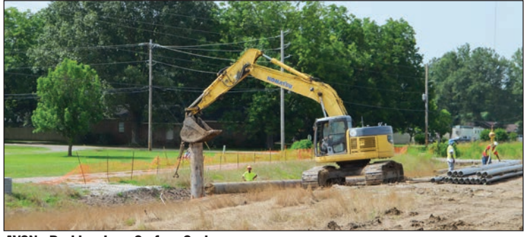
AVON - Pushing down Surface Casing

lem areas discovered during the Epic 2011 Flood will have been corrected. The 11 problem areas will be corrected by installing 187 relief wells and constructing 20,405' (3.9 miles) of landside seepage berm. The Vicksburg District Corps of Engineers has utilized 5 separate contracts totaling $11.3M. The Mississippi Levee Board would like to thank Congress for appropriating the emergency money and the Corps of Engineers for designing and contracting out the work to repair these problem areas. ■