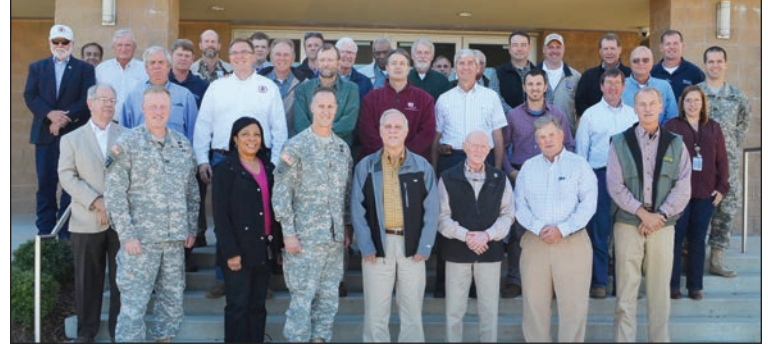
Members of the 2014 Annual Levee Inspection take a photo in front of Harlow's Casino.

On November 6, 2014, the Mississippi Levee Board hosted its Annual Levee Inspection. This year's trip inspected the south portion of the levee system starting at Hwy 61 and the Yazoo Backwater Levee and proceeding north through Item 456L – Tara Seepage Control Project on the Brunswick Extension Levee and continuing north on the Mainline Mississippi River Levee through Item 463L – Levee Enlargement Project.