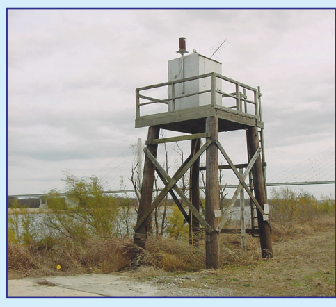
Current Greenville Gage

readings to an elevation in which all are referenced to the same datum or point that we can see the fall in water surface elevation as we head downstream. For that we need to know the "Zero" gage value for each station. Gage zero for Arkansas City (river mile (RM) 554.1), Greenville (RM 531.3), Vicksburg (RM 435.4) and Natchez (RM 363.3) are 96.66', 74.92', 46.23' and 17.28' respectively. So, when we add the gage zero value to the gage reading at each station from Arkansas City on down, we get elevations: Arkansas City - 106.20', Greenville - 93.05', Vicksburg - 61.17' and Natchez - 42.35'. You can now easily see that the water surface is dropping as we