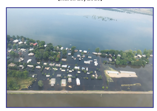
Eagle Lake Community flooded - Backwater 98.2 (May 23, 2019)