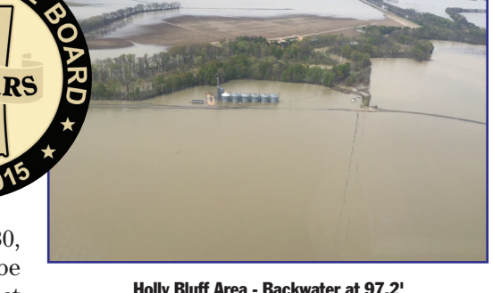
Holly Bluff Area - Backwater at 97.2 (March 29, 2019)

"Today, Sen. Hyde-Smith accused me of advocating for the Yazoo Pumps Project in Mississippi while not supporting it in Washington," Thompson said. "The senator is wrong. I have gone on record in support of this project, and it is documented. Now, she has the burden to produce a list of the people I have spoken to against the pumps project."