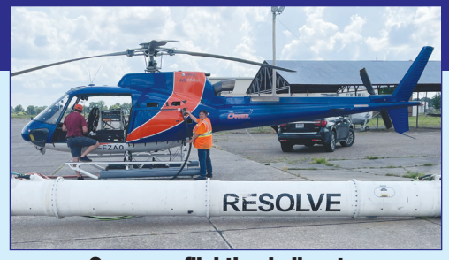
Crews preflighting helicopter

The survey is in part a result of the Mississippi Alluvial Plain (MAP) Water Availability Study through the U.S. Geological Survey. Appropriated by Congress in 2017, the project seeks to better understand how