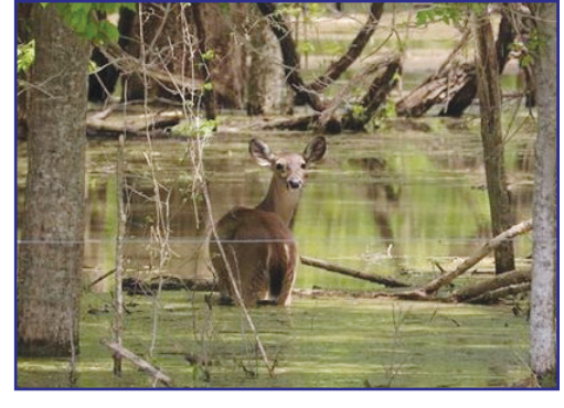
Deer in Backwater Floodwater