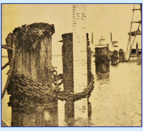
Old River Gage

readings to an elevation in which all are referenced to the same datum or point that we can see the fall in water surface elevation as we head downstream. For that we need to know the "Zero" gage value for each station. Gage zero for Arkansas City (river mile (RM) 554.1), Greenville (RM 531.3), Vicksburg (RM 435.4) and Natchez (RM 363.3) are 96.66', 74.92', 46.23' and 17.28' respectively. So, when we add the gage zero value to the gage reading at each station from Arkansas City on down, we get elevations: Arkansas City - 106.20', Greenville - 93.05', Vicksburg - 61.17' and Natchez - 42.35'. You can now easily see that the water surface is dropping as we